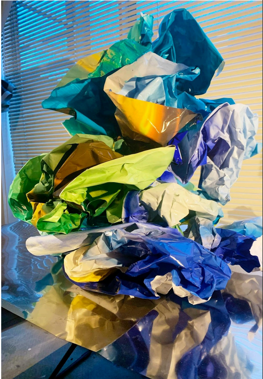
Figure 1: Anne Scott Wilson, 'Mimetic AI005, 2024, Melbourne 60 x 80 cms, digital print on Bartya photographic paper, ink, varnish