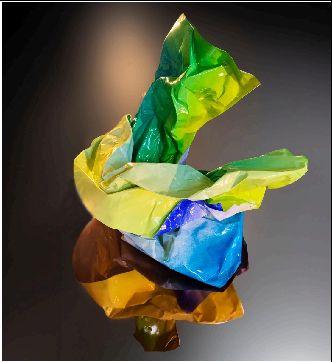
Figure 2: Anne Scott Wilson, 'Mimetic AI002, 2024, Melbourne 60 x 60 cms, digital print on Bartya photographic paper, ink, varnish