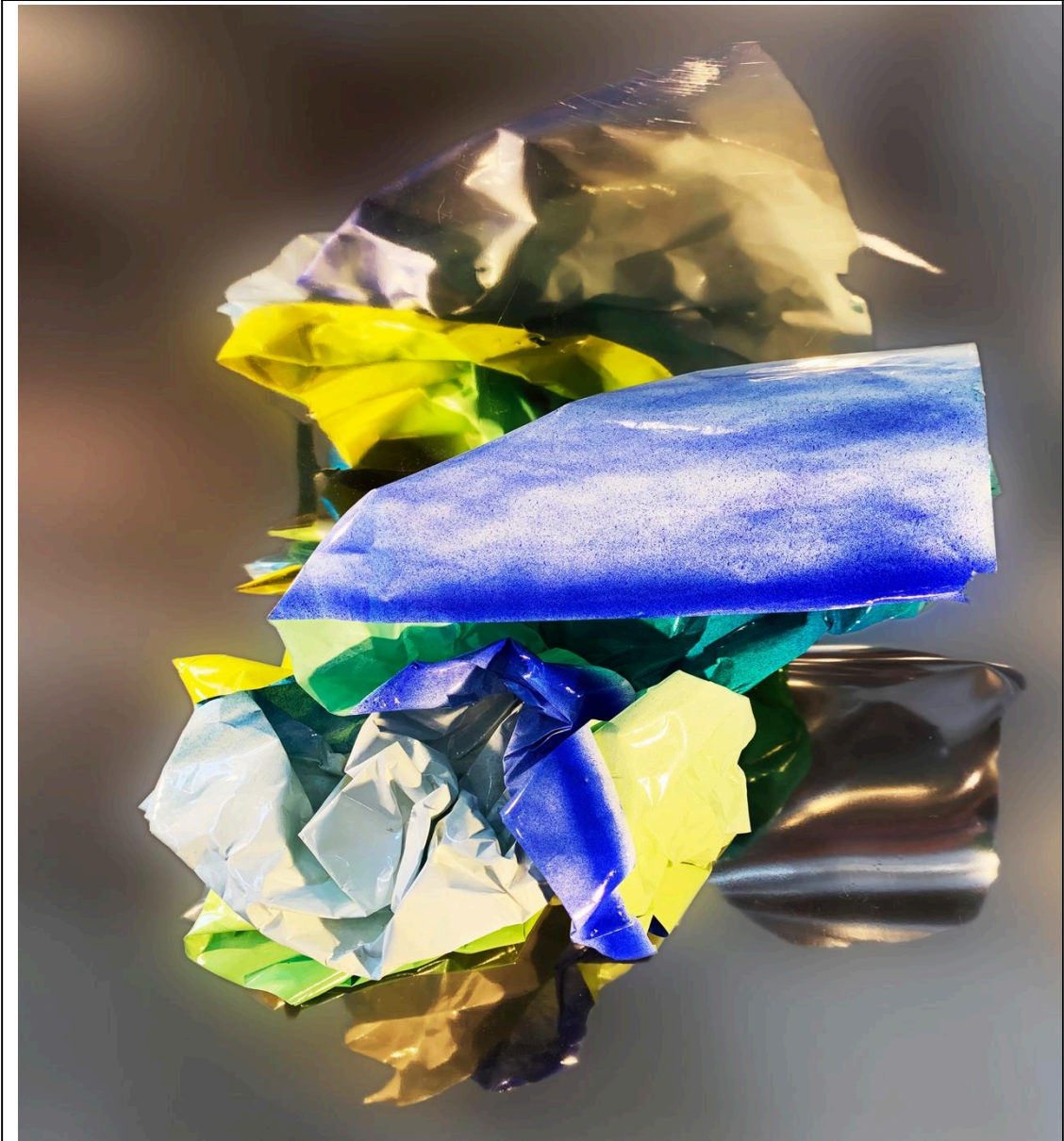
Figure 1: Anne Scott Wilson, 'Mimetic AI001, 2024, Melbourne 60 x 60 cms, digital print on Bartya photographic paper, ink, varnish

5 images of your work, or related works, with captions and photo credits in Chicago format. (A “hero image” should be nominated).