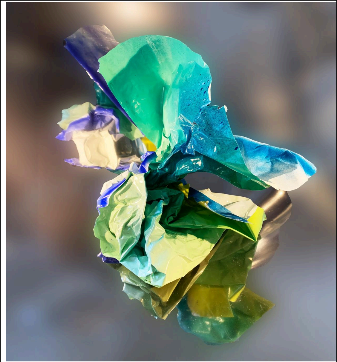
Figure 3: Anne Scott Wilson, 'Mimetic AI003, 2024, Melbourne 60 x 60 cms, digital print on Bartya photographic paper, ink, varnish